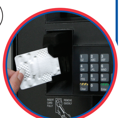
PAV AT THE PUMP!